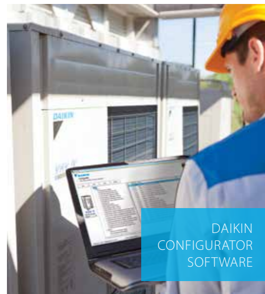
DAIKIN CONFIGURATOR SOFTWARE